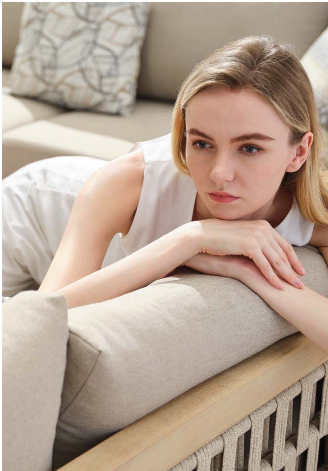
Super thick cushions with high density foams for an extra soft seating experience.