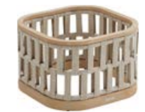
206493 Flower Basket Size: 530x530x360mm