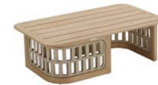
206481 Coffee Table Size: 1200x700x400mm