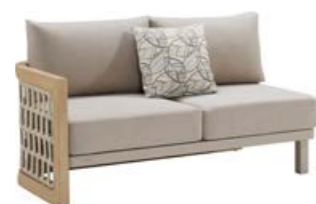
206427 Left Double Corner Sofa Size: 740x1410x600mm