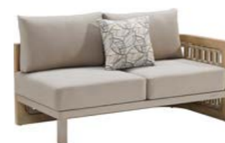
206429 Right Double Corner Sofa Size: 740x1410x600mm