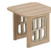
206461 Side Table Size: 500x500x450mm