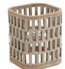
206492 Flower Basket Size: 530x530x620mm