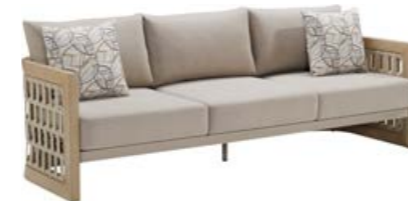
206441 Three-seater Sofa Size: 740x2140x600mm