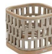
206491 Flower Basket Size: 530x530x440mm