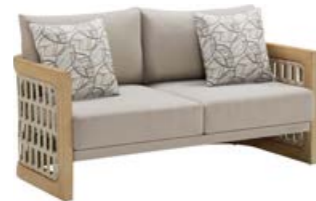
206431 Double Sofa Size: 740x1460x600mm