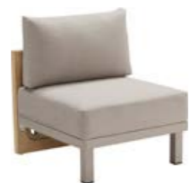
206408 Middle Sofa Size: 740x680x600mm