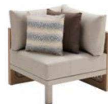
206428 Middle Corner Sofa Size: 740x740x600mm