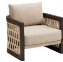
206411 Dining Chair Size: 615x610x670mm