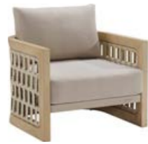
206421 Single Sofa Size: 740x780x600mm