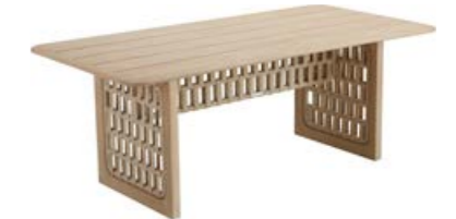
206471 Dining Table Size: 2000x1000x750mm